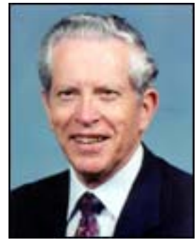
Sen. Lowen Kruse

local officials in the municipality where the license is sought.