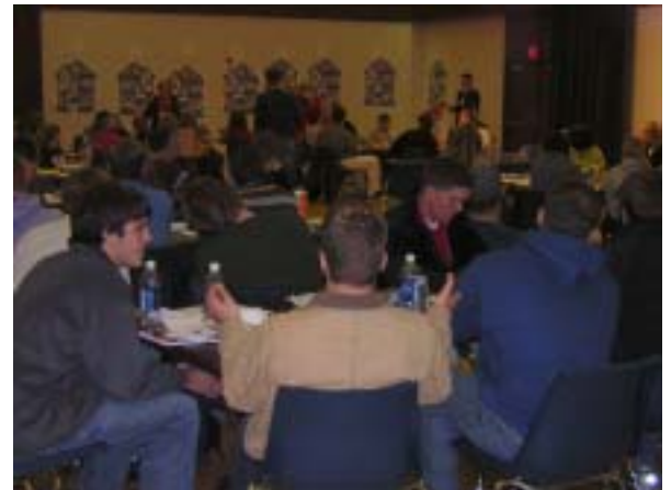
Members of Beta Theta Pi fraternity discuss their chapter’s strengths and weaknesses in the “house-building” activity of the Deep Change workshop.